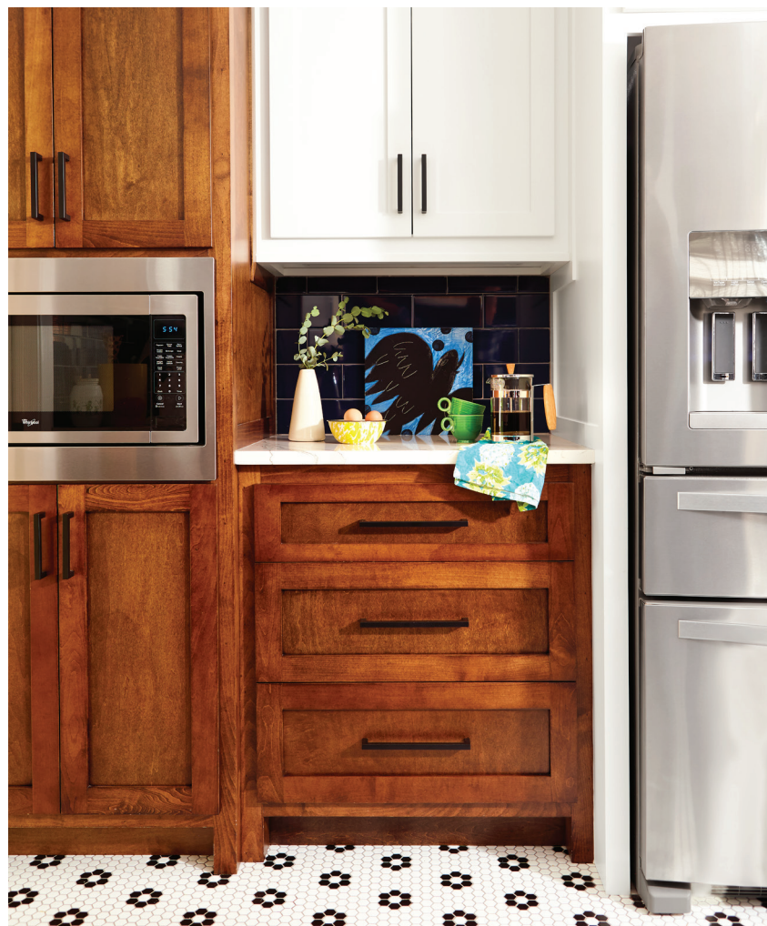
When the countertops and cabinets were reconfigured, this sweet little spot was created. In the morning it's a coffee and breakfast center. Come evening it morphs into a wine and cheese hub. The art is by local artist Glory Day Loflin.

It's the eternal good looks of marble in an easy-to-maintain Cambria quartz look-alike. Gray veining adds a bit of pattern to a room filled with solid finishes; the swirls offset the straight lines of the Shaker-style cabinets and the subway tile.